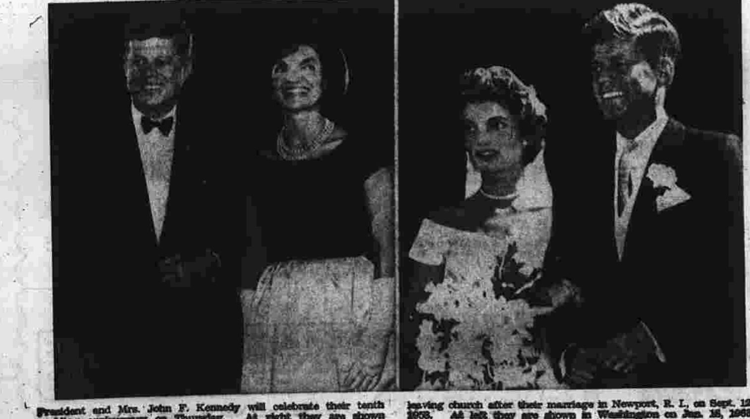
President and Mrs. John F. Kennedy will celebrate their tenth wedding anniversary on Thursday. At right they are shown leaving church after their marriage in Newport, R. I., on Sept. 12, 1958. At left they are shown in Washington on Jan. 25, 1965.

ALGERIA VOTES — Denounced by foes as a blueprint for dictatorship, a new constitution making Algeria a one-party Socialist state was approved by strongman Ahmed Ben Bella went into effect today.