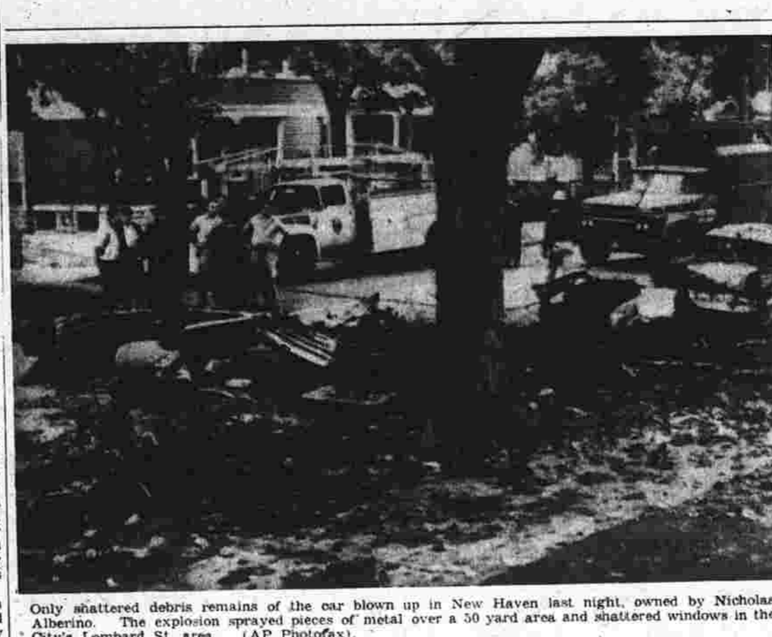
Only shattered debris remains of the car blown up in New Haven last night, owned by Nicholas Alberino. The explosion sprayed pieces of metal over a 50 yard area and shattered windows in the City's Lombard St. area.